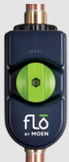
Flo by Moen

Sure, it's pretty to keep those backyard decorative lights on all night, but what is it costing you in real dollars? Questions like this are on homeowners' minds as they try to save money against the steady flow of energy costs increases. Plan your usage of appliances and lights to fit your budget by installing a home energy monitoring device. These smart devices will help you save money by understanding how you consume energy at home.