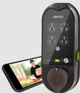
LOCKLY Vision Deadbolt with Video Doorbell

Small drips turn into a disaster, given enough time to rot the backside of the wall where it is happening. Many insurance companies will exclude damage from slow leaks in homeowners insurance, leaving the expense to the homeowner. Get ahead of the potential damage by installing a leak detector. You can install them either at particular locations or use a whole-home leak detection system installed at your water main.